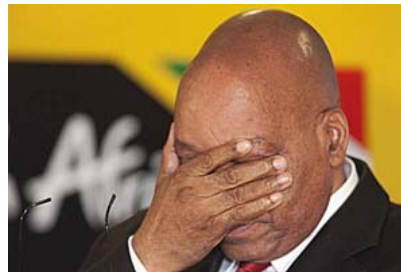
President Jacob Zuma.